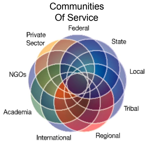
Service Integration Model